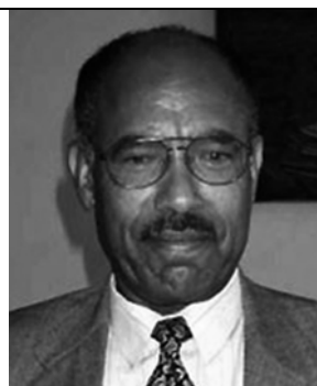
Hailu Shawel

The 76 defendants before the court include most of the central council and principal leadership of the CUD coalition party ( Kinjit in the Amharic language), mainly from its two leading parties – the All Ethiopia Unity Party (AEUP), which was formed from the previous All-Amhara People’s Organization (AAPO), and the recently-formed Rainbow Movement for Democracy and Social Justice in Ethiopia ( Kestedemena in Amharic).