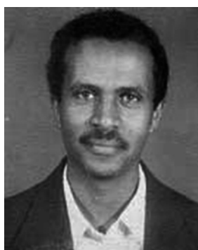
Eskinder Negga