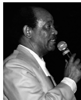
Debebe Eshetu