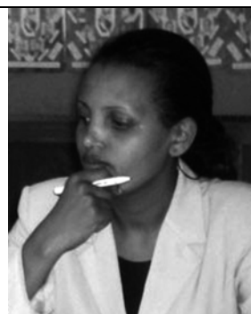
Birtukan Mideksa