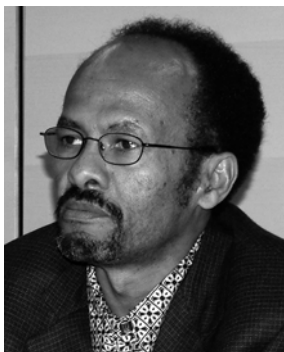
Taye Woldeamayrat ©AI