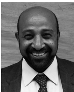
Berhanu Negga ©AI